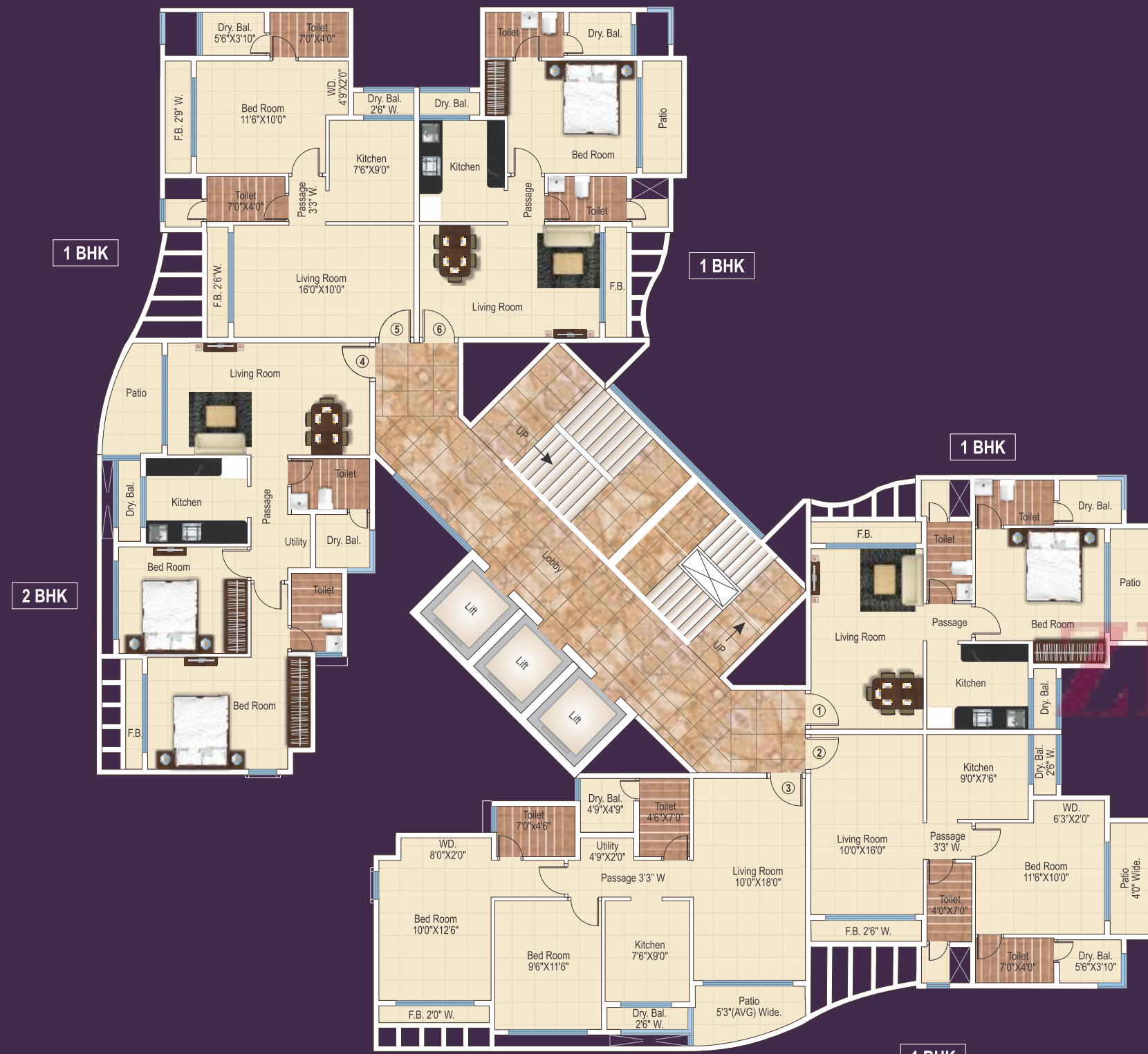
TYPE - G-2 Odd Floor Plan