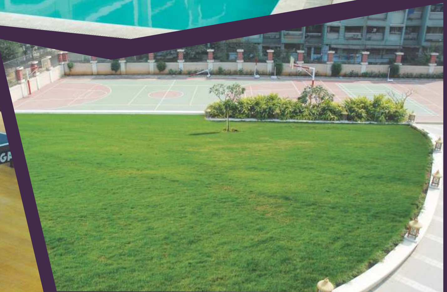
Actual Clubhouse images