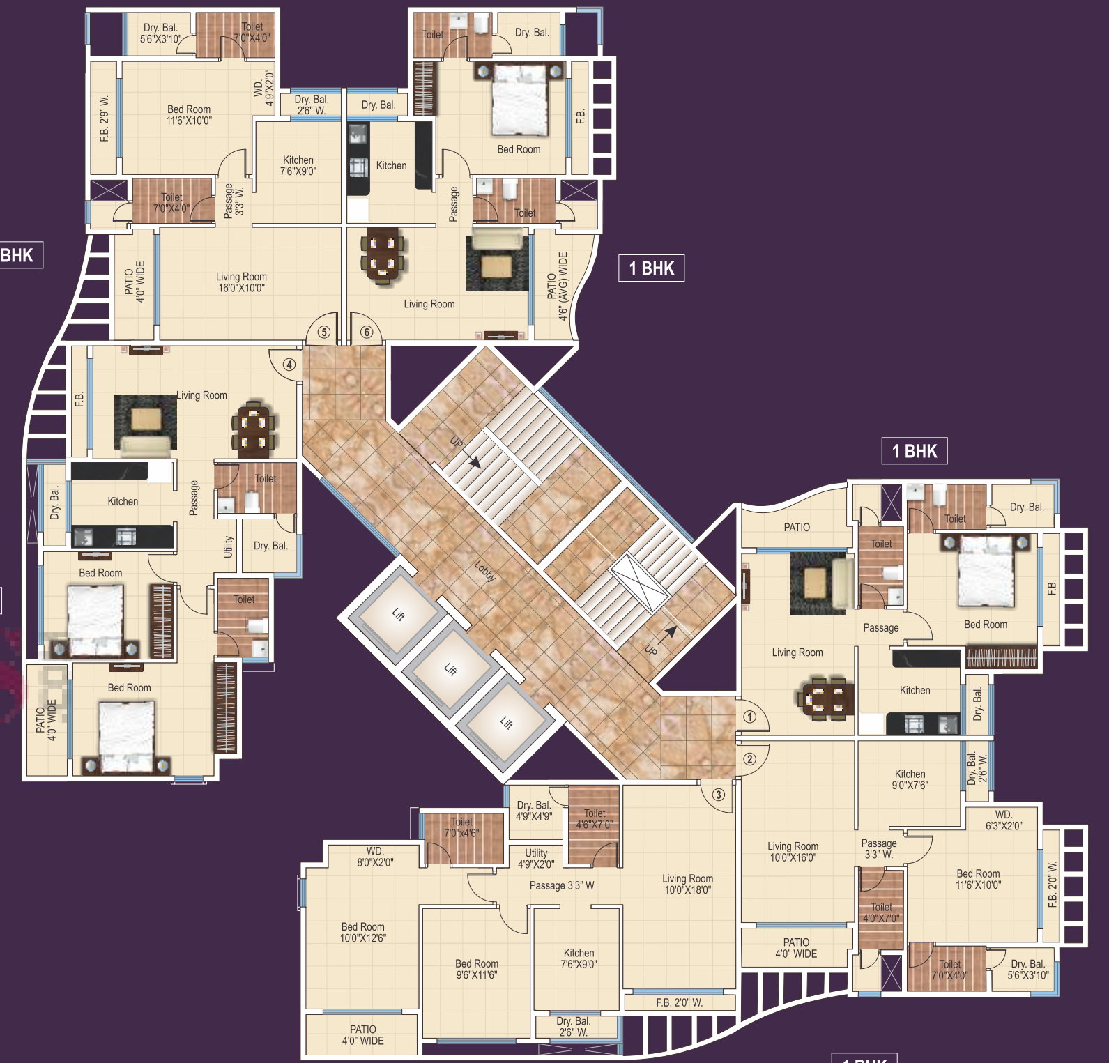
TYPE - G-2 Even Floor Plan