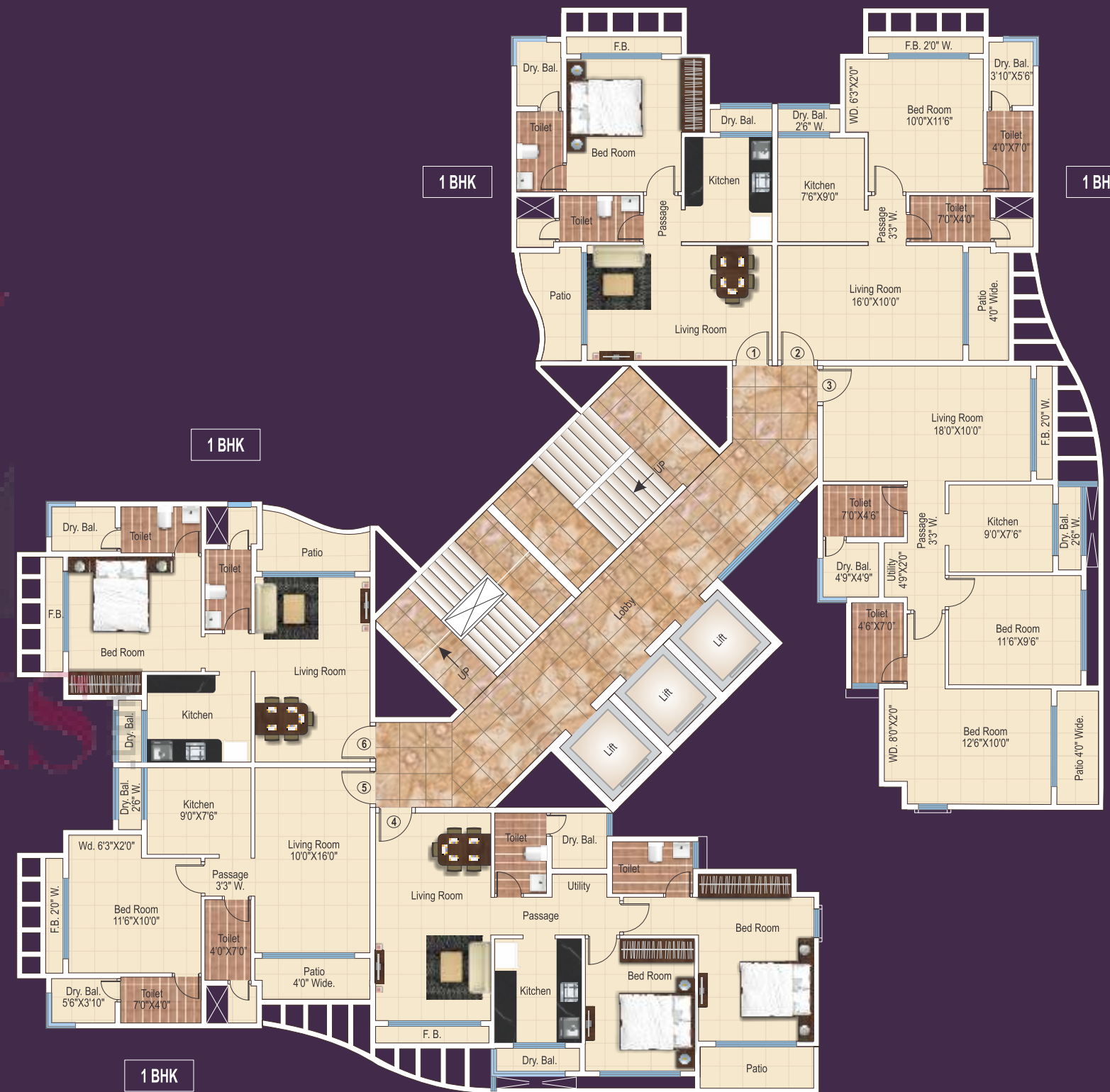
TYPE - F Even Floor Plan