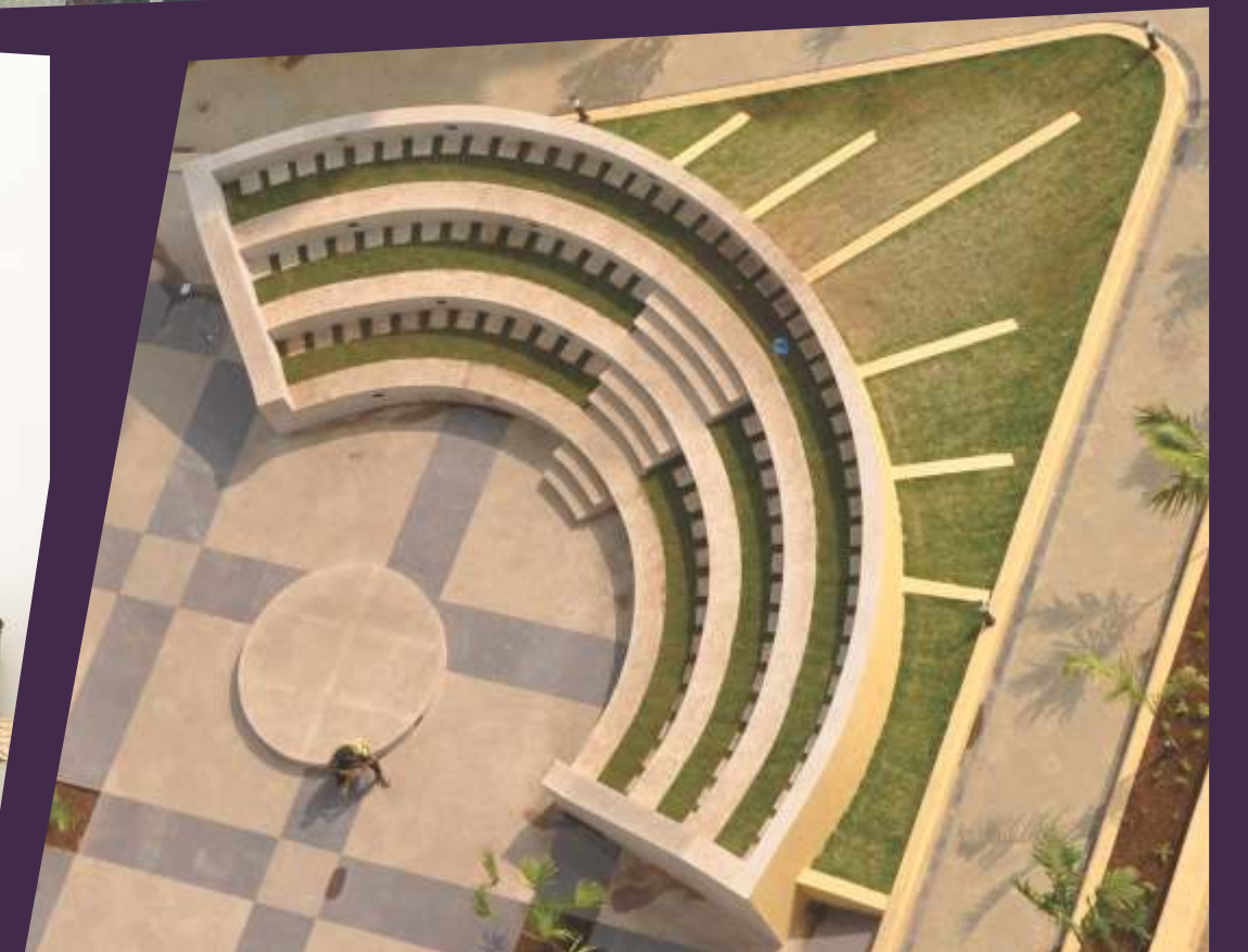
Actual images of recently delivered project, YOGI DHAM